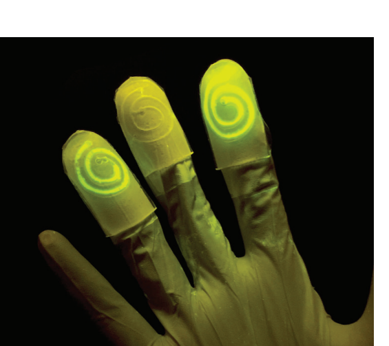
New "living material" lights up in the presence of certain chemicals.